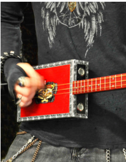
Color Print by Alan Forney